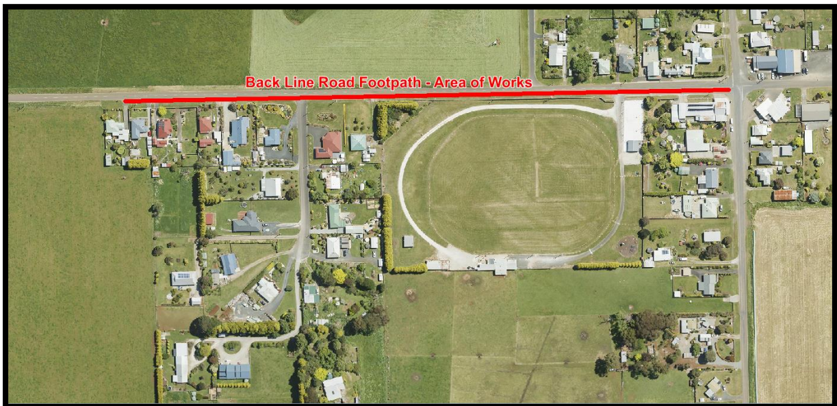
Figure 2 – Back Line Road, Forest Footpath Full Scope of Works

Complete the full length of works for a footpath on the southern side of Back Line Road, Forest completing the work which was commenced under round 1 of the LRCI fund.