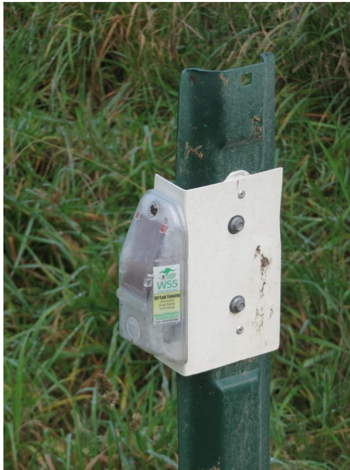
Figure 3 Virtual Fencing Roadkill Mitigation

This project will form part of a broader suite of measures involving groups such as the Cradle Coast NRM, Save the Devil Project and other agricultural industry partners to reduce roadkill. A focus of the measures is to help protect Tasmanian Devil population in the area.