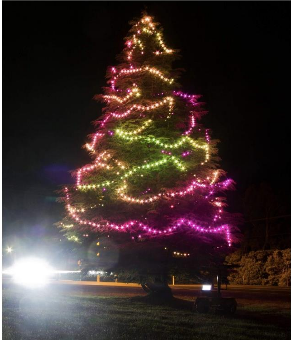
Figure 4 - Concept of LED event Lighting

The tree is decorated annually with Christmas Lighting. It is proposed to seek funding to install permanent lighting which will be able to be used for various events all year round, as well as avoiding the annual costs associated with fitting and removing the current lighting.