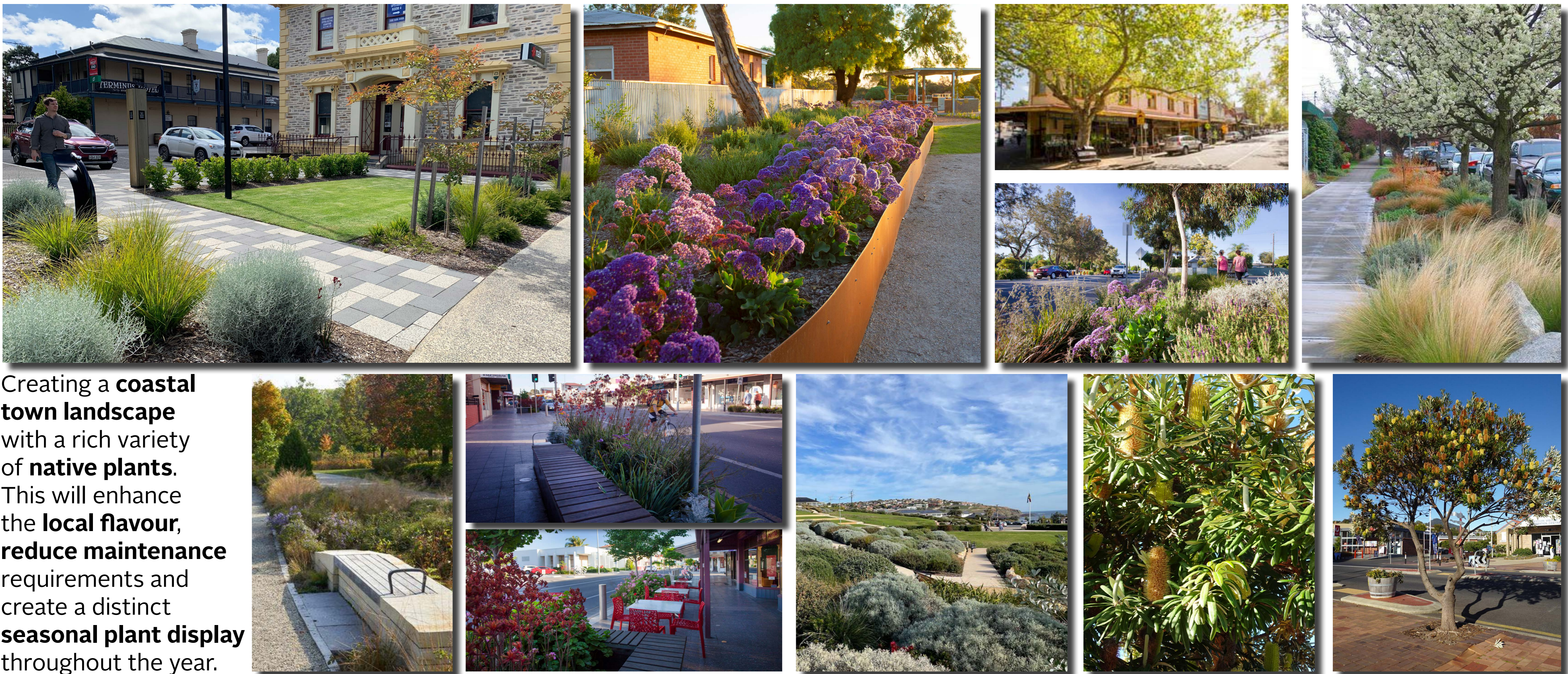
Larger, canopy street trees

Creating a coastal town landscape with a rich variety of native plants . This will enhance the local flavour , reduce maintenance requirements and create a distinct seasonal plant display throughout the year.